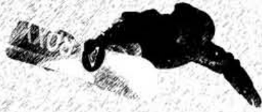
Australia's Torah Bright 2010 Olympic Halfpipe Champion